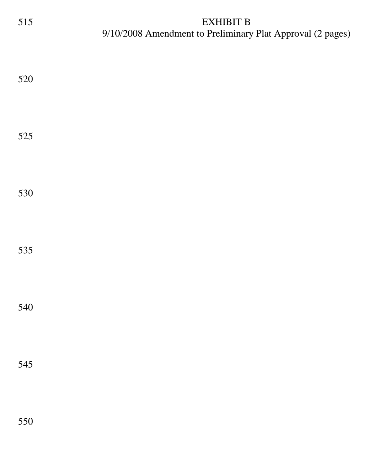
Page 15 - DEVELOPMENT AGREEMENT